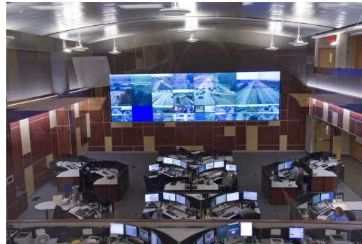
SE Michigan Transportation Operations Center

County, Madison Heights, Melvindale, Michigan State Police, Novi, Oakland County, Official Towing, River Rouge, Riverview, Romulus, Roseville, SEMCOG, Southfield, Sterling Heights, Traffic Improvement Association, Troy, Van Buren Township, Wayne County, WXYZ, and Westshore Fire.