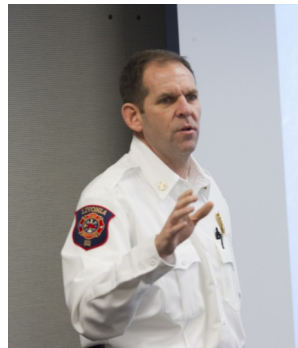
Livonia Fire Chief Shadd Whitehead

HAZMAT teams in Metro Detroit and that they are organized to share resources. The Tanker Rollover at Interstate-696/Halsted involved a cargo of jet fuel that had to be emptied to avoid environmental damage. Because there was some delay in getting all the proper equipment on site there was some delay in opening the freeway.