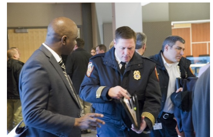
Networking to coordinate